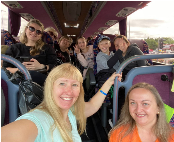
The Choir at the Mother Jones Festival

With the support of the Community Foundation of Ireland, we managed to organise three summer cultural 'KALYNA' camps and trips for Ukrainian families to Rosscarbery's 'Smugglers Cove' and the Farran Woods ZIPIT club. Thank you so much to all who have been supporting us all this time!