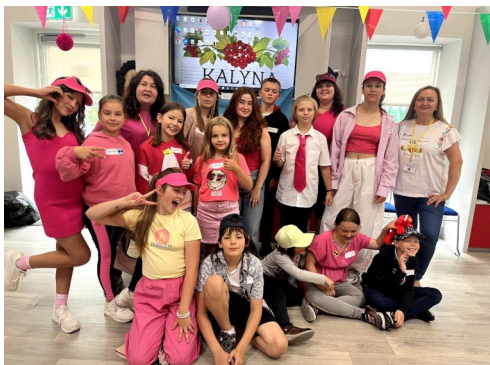
All the 'Barbie' fans before the cinema trip.